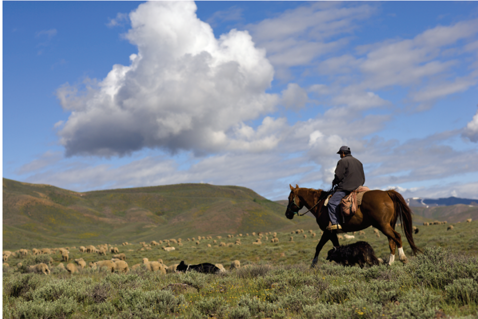
Fig. 1. —Lava Lake herder and herding dogs among the sheep.

unprotected areas, though the sheep are counted during shipping and at the end of the grazing season, which makes this scenario unlikely.